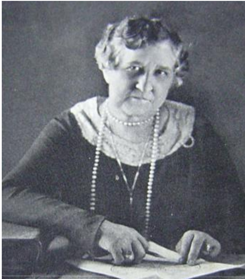
Figure 6. Evangeline Adams (1868 – 1932) was the most famous astrologer in the first third of the twentieth century. Like Lewis, she was a master of communication and publicity and eventually hosted a radio program. Although the author has found no proof Lewis and Adams knew each other personally, the name of Adams’s radio program (Sweet Mystery of Life) suggests she might have known about Lewis or known other Rosicrucians. Since its early days, AMORC has used an instrumental version of the song “Ah! Sweet Mystery of Life” in its rituals. 41 This image is in the public domain.

The most famous astrologer in the first third of the twentieth century was Evangeline Adams (February 8, 1868 - November 10 or 12, 1932). Adams achieved fame in New York in 1899 with an astrological prediction that proved accurate, and she moved to the city in 1905. 40