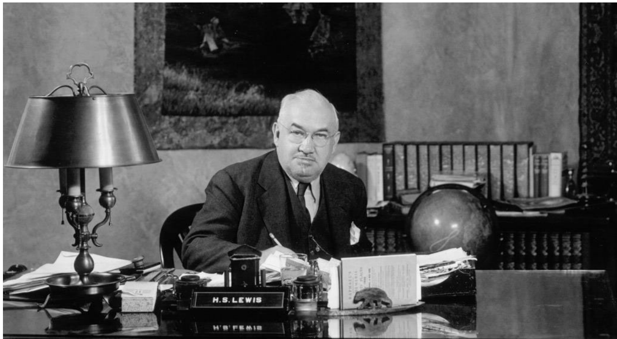
Figure 1. Among many other skills and talents, H. Spencer Lewis was a longtime professional astrologer.

While many Rosicrucians may be aware of H. Spencer Lewis's early career in publishing, few today know that he also worked as a professional astrologer.